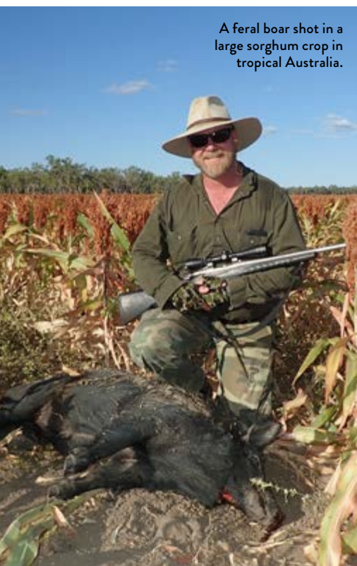
A feral boar shot in a large sorghum crop in tropical Australia.

Years ago, when I was a lot younger, I shared hunting access to a property with another hunter, an old fella. In prowling through the lantana-packed gullies I would