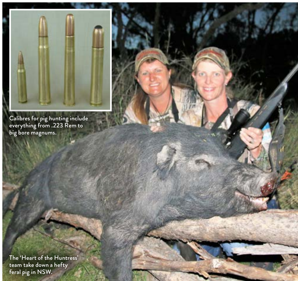
The 'Heart of the Huntress' team take down a hefty feral pig in NSW.

often find his kills and was left wondering why he was so much more successful than me. Then, one day, we happened to both be on the property at the same time. We compared rifles, optics and knives, as you do, then he showed me his 'pig dog'. It was the family Jack Russell terrier. The dog's job, which he was very good at, was to trot along about 30m ahead of the hunter and duck in under every patch of lantana.