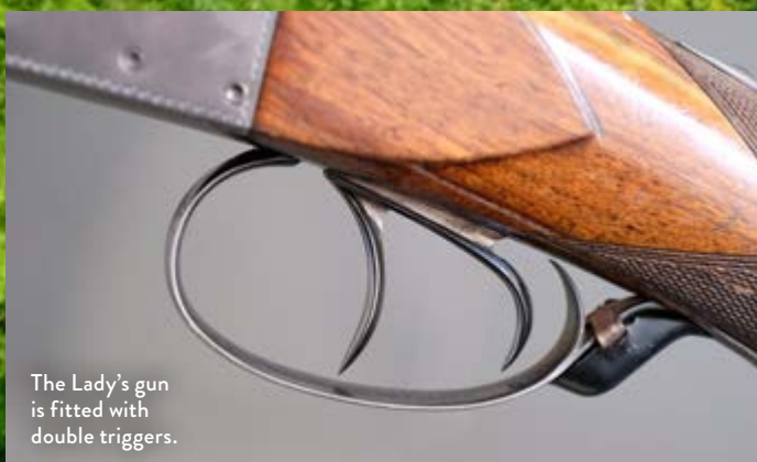
The Lady's gun is fitted with double triggers.

The Lady's gun was as much his as any of the others and the idea of someone actually using it appealed to her. So, I landed the Lady's gun.