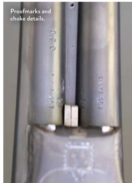
Proofmarks and choke details.