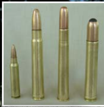
Calibres for pig hunting include everything from .223 Rem to big bore magnums.