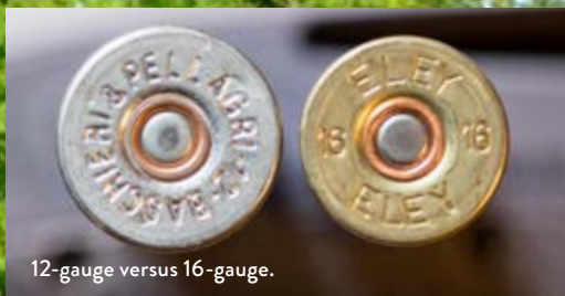
12-gauge versus 16-gauge.