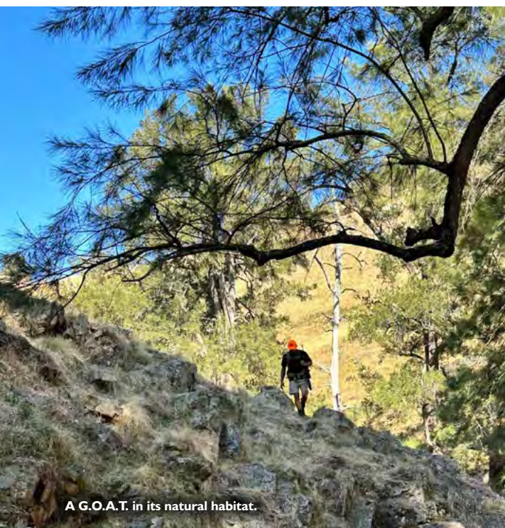
A G.O.A.T. in its natural habitat.