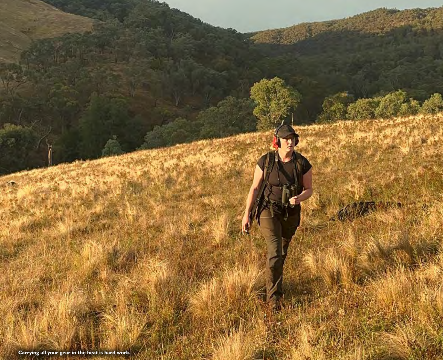
Carrying all your gear in the heat is hard work.