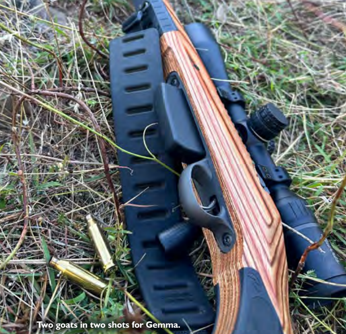
Two goats in two shots for Gemma.