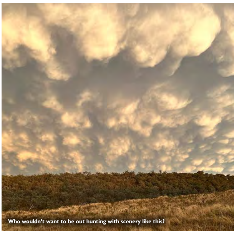
Who wouldn't want to be out hunting with scenery like this?