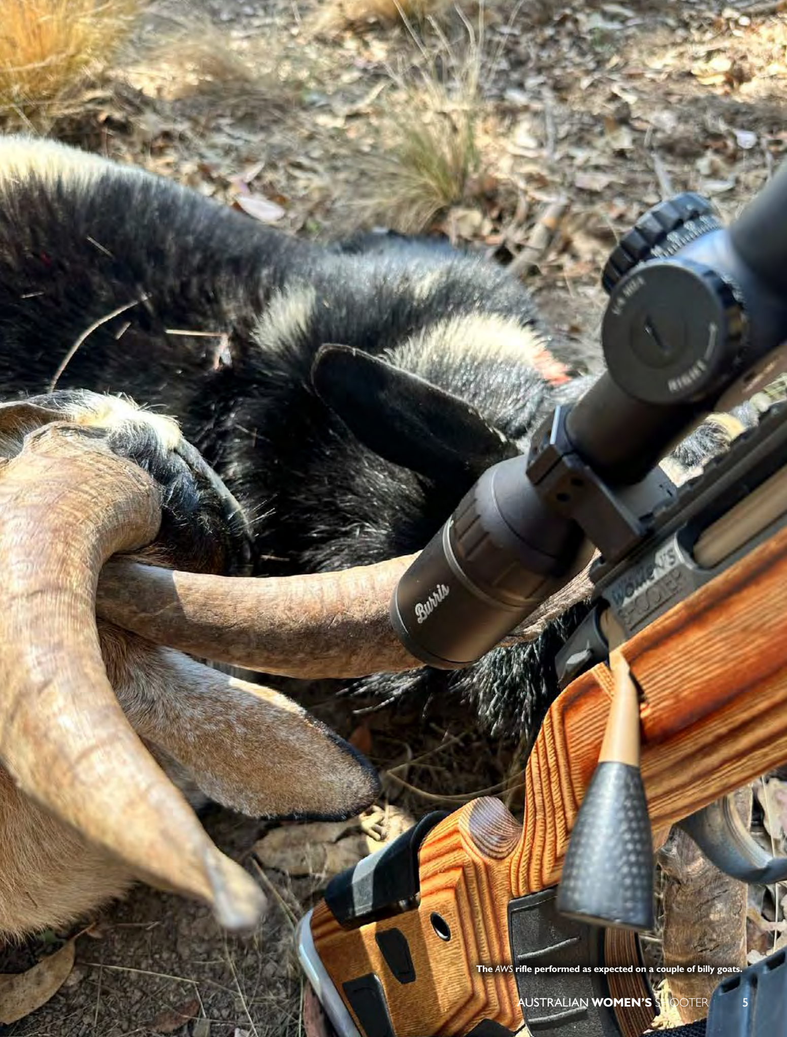
The AWS rifle performed as expected on a couple of billy goats.