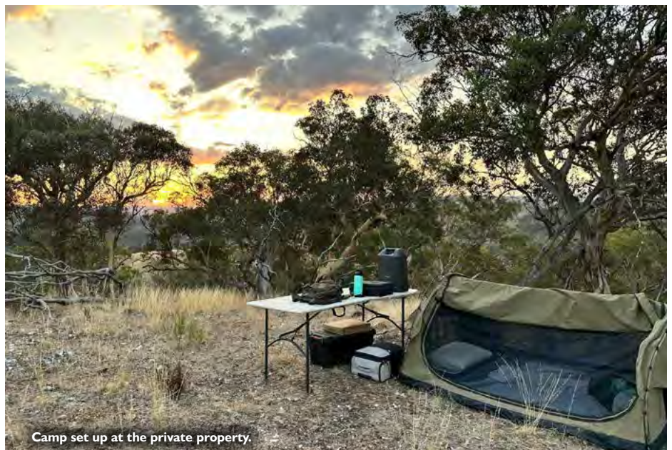
Camp set up at the private property.

The main aim for me on this trip was to see how the rifle performed away from the shooting range, in a hunting situation. Those who have read the previous articles might