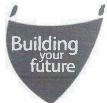
Will Hodgman MP Liberal Leader

A handwritten signature in black ink, appearing to read 'Will Hodgman'.