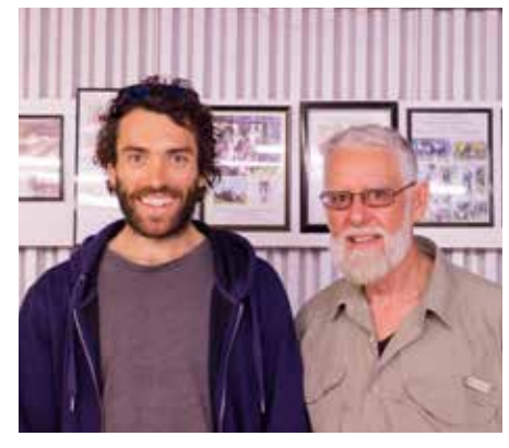
Rod's offers some words of wisdom.

One thing I wish I'd known before I signed up for 3P competition is it's