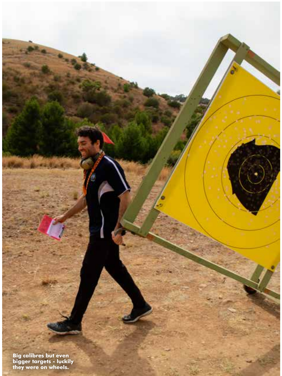
Big calibres but even bigger targets - luckily they were on wheels.

There are quite a few other types of matches shot in Combined Services which demand even more position changes and strict time limits but the main 3P event is more than enough