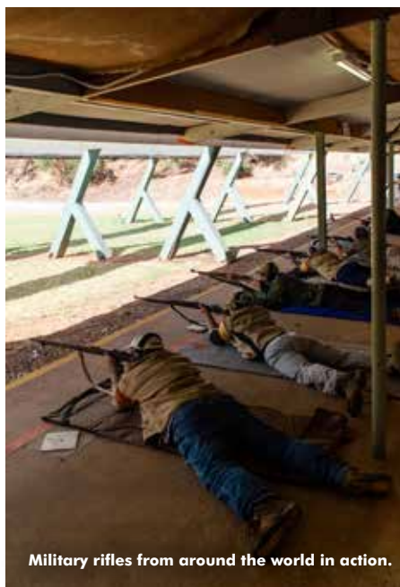
Military rifles from around the world in action.

Recoil feels about the same as a shotgun, which may sound like it