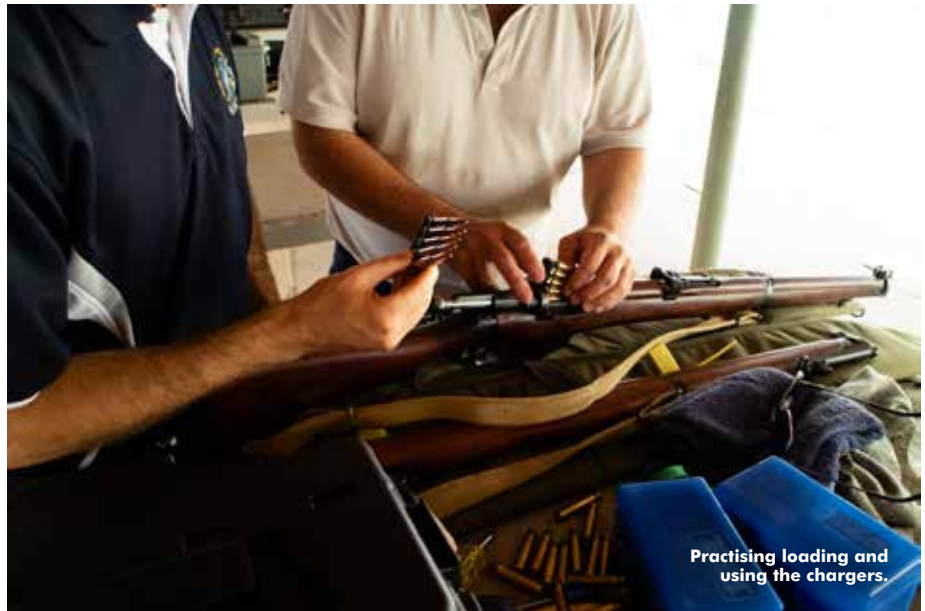
Practising loading and using the chargers.

From both a history lesson and shooting perspective I had a great time. There are so many different and unique rifles for