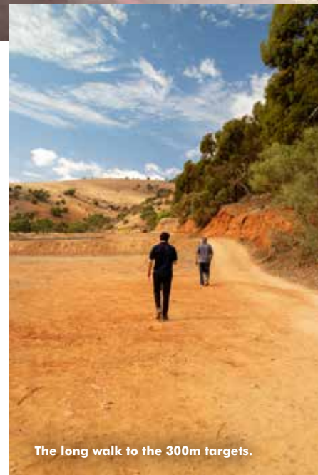
The long walk to the 300m targets.

Next it was time to talk about the vast array of rifles on display. The first detail of shooters featured a Martini Enfield, Swedish Mauser M96, a Number 4 and Springfield 03, a snapshot of rifles from around the world and across different time periods. They also represent different solutions to problems, advances in technology, cultural differences, manufacturing abilities and ongoing refinements for military purposes and it's no surprise many