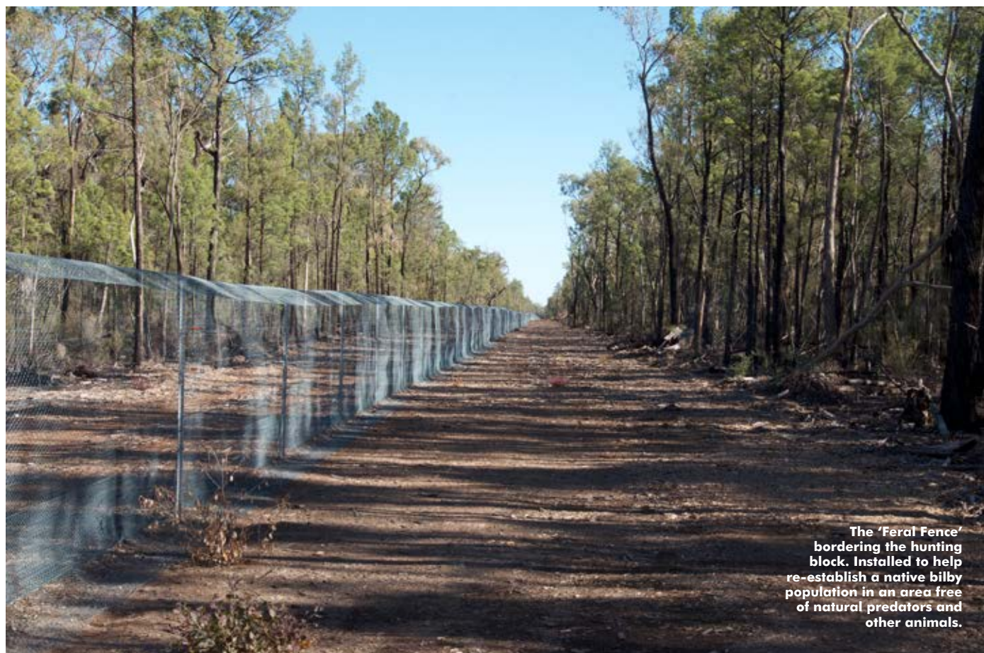
The 'Feral Fence' bordering the hunting block. Installed to help re-establish a native bilby population in an area free of natural predators and other animals.

Meat was taken during our weekend away and my eldest watched and even wanted to join in the butchering. A big part of the whole process focused on knives and respecting such blades as tools, not toys.