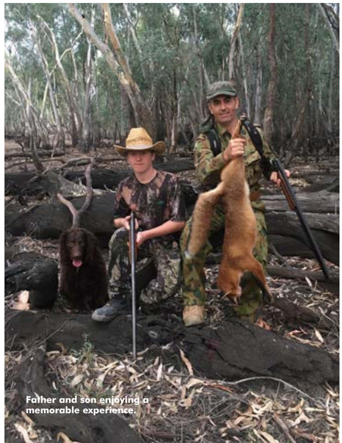
Father and son enjoying a memorable experience.