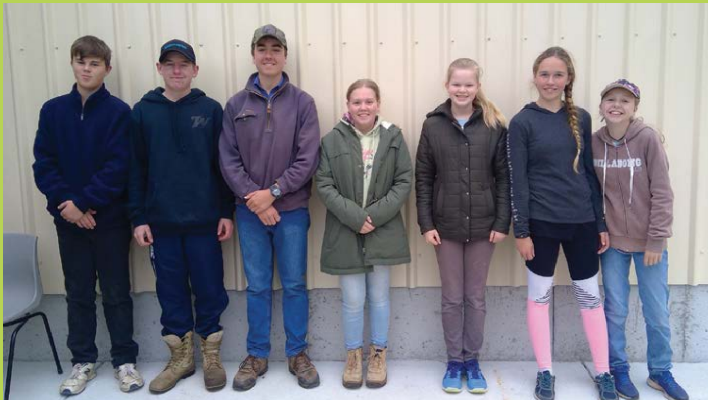
Magnificent seven: The juniors who shot in the NSW Benchrest and IRB championships.

With so many juniors involved, this year's event had a real family feel with competitors and volunteers alike enjoying great camaraderie and sportsmanship. ●