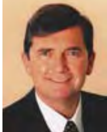
Senator Chris Ellison, Government Minister for Justice and Customs