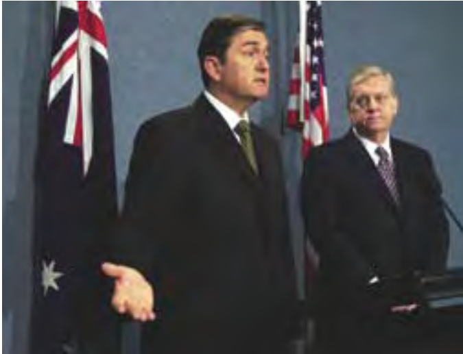
Senator Chris Ellison, The Liberal Party.

this issue through the establishment of a multi-jurisdictional taskforce to examine the scope and nature of firearm trafficking. We have also tightened border controls to target the illegal importation of guns. For example, we have introduced two cross-border firearm trafficking offences that carry a substantial maximum penalty of ten years' imprisonment and/or a fine of $275,000. We have strengthened border protection measures by introducing state-of-the-art x-ray facilities and improved intelligence gathering. Statistics collated by the Australian Institute of Criminology indicate that the incidence of firearms-related crime in Australia is decreasing. For example: