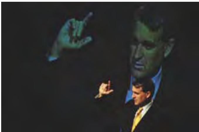
John Anderson, The Nationals.