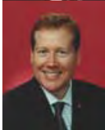
Senator Brian Greig, Australian Democrats' Spokesperson for Attorney- General and Justice.