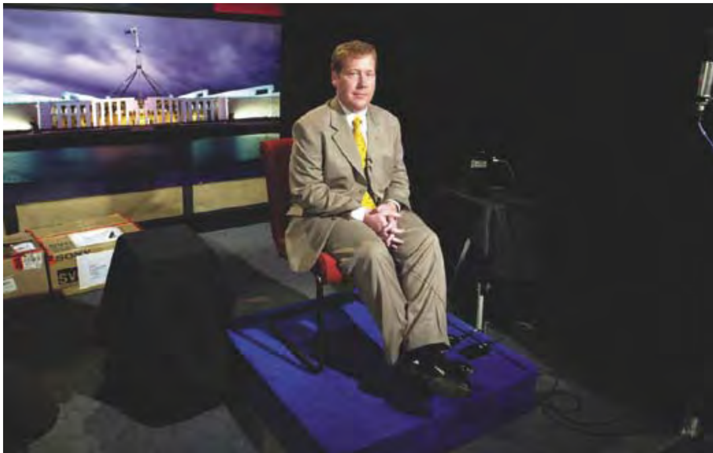
Senator Brian Greig, The Australian Democrats.

firearm restrictions. It's unfortunate that the legitimate sporting and leisure activities of a section of the community have been restricted, however the policy justification for such restrictions is compelling - the safety of the Australian community must be the primary consideration.