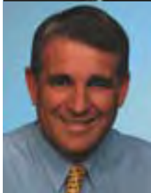
John Anderson, Deputy Prime Minister and Leader of the Nationals.