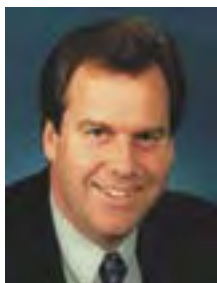
Robert McClelland, Shadow Minister for Homeland Security.