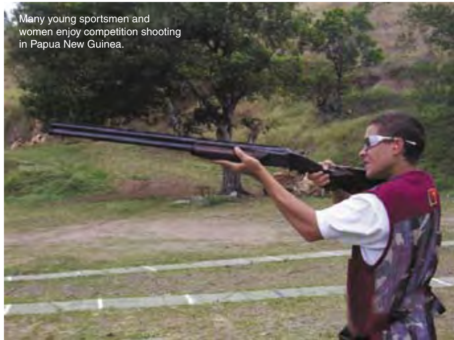
Many young sportsmen and women enjoy competition shooting in Papua New Guinea.

http://www.pacificmagazine.net/pm32003/pmdefault.php?urlarticleid=0029