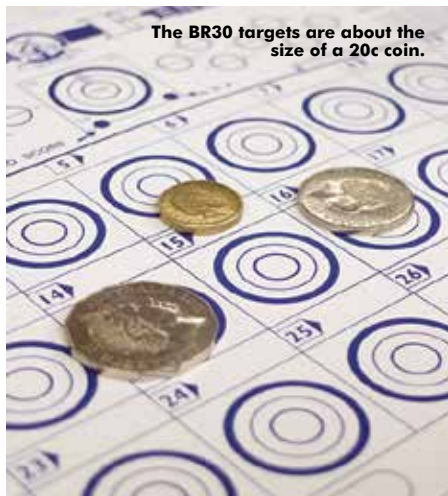
The BR30 targets are about the size of a 20c coin.