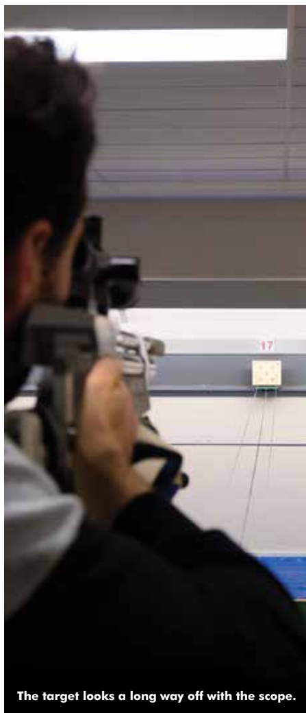
The target looks a long way off with the scope.

For the beginner, air rifles are an ideal introduction to the sport without the issues of recoil and noise. For example, outfits like the Scouts are particularly keen on air rifle shooting. On the other hand, air rifles offer a fresh challenge for experienced shooters and are a fantastic tool for hunters - and the cost of pellets is probably the cheapest of all projectiles. ●