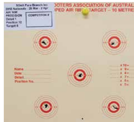
Impressive work by Rod Frisby.