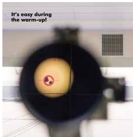
It's easy during the warm-up!