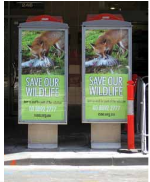
Various promotional material for the Be Part of the Solution campaign.