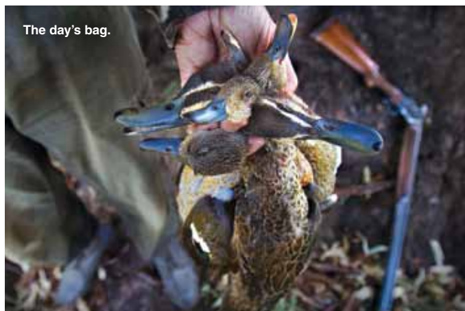
The day's bag.

"But there is an awful lot of people who say they can't hunt but they're eating a steak or a chicken and not thinking about where it comes from." The other central argument here is that farmed animals are marked for slaughter from the moment they are born,