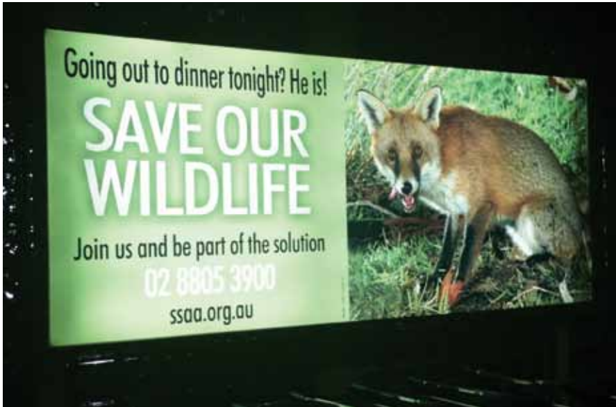
Be Part of the Solution billboards were placed at the Canberra Airport and Melbourne CBD as part of the campaign.