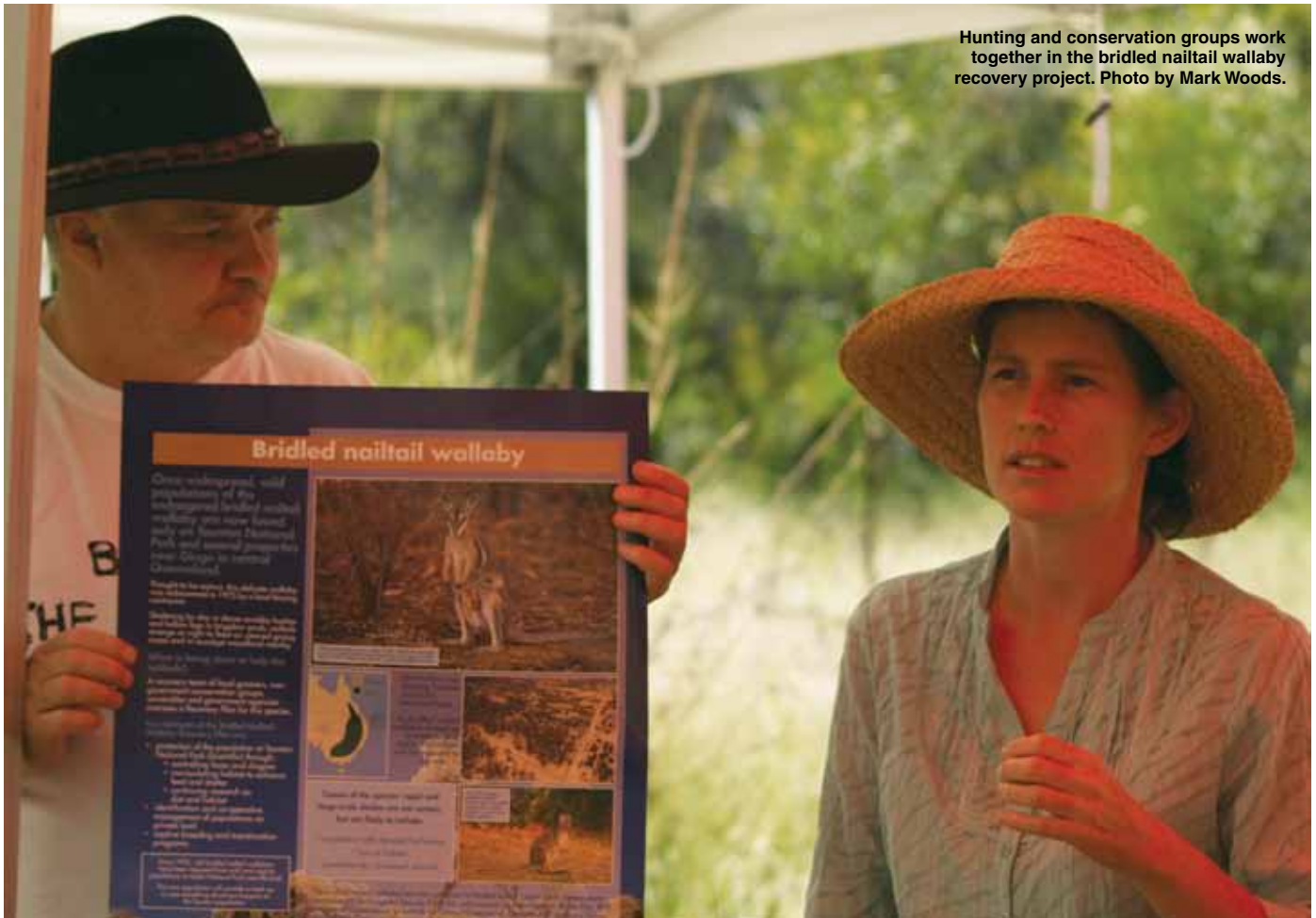
Hunting and conservation groups work together in the bridled naitail wallaby recovery project.

A bridled naitail wallaby recovery project located near Emerald in Queensland is a good example of collection of hunting and conservation groups working together. The SSAA Queensland Conservation & Wildlife Management Branch plays an integral part in a team of stakeholders trying to save this endangered species. This SSAA group is responsible for feral predator control to limit the loss of young wallabies to feral cats and foxes. The SSAA members also participate in other activities, such as ground surveys and data collection, which enhances their value to the conservation project even further.