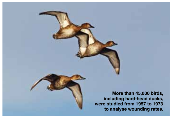
More than 45,000 birds, including hard-head ducks, were studied from 1957 to 1973 to analyse wounding rates.

The unreferenced claims by animal welfare and rights groups of 50% wounding and 66% crippling in ducks today is highly alarming because it ignores the research that demonstrates that it was never this high in Australia and it ignores the reforms that ensure it affects less than 5% of a locally hunted population of birds.