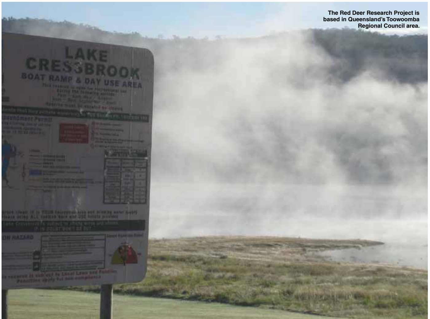
The Red Deer Research Project is based in Queensland's Toowoomba Regional Council area.

Further to its involvement in the Red Deer Research Project, the SSAA is developing a conservation and wildlife research fund that will enable it to fund wildlife research that is beneficial to our interests into the future. Many Australian game species have had limited research compared with overseas species in other parts of the world. This is certainly one way that the SSAA can help address this issue for the good of our members and our valued game species.