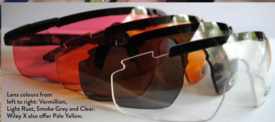
Lens colours from left to right: Vermillion, Light Rust, Smoke Grey and Clear. Wiley X also offer Pale Yellow.

However, after more than 10 years, it is good to see that there are some more affordable alternatives starting to arise in the shooting glasses market. Many are just offering a smaller assortment of lens colours, to cover the basics. This is important because as a beginner, you are simply wanting to purchase the basic equipment you need, to start developing your skills and learn what it all means. After that, you can choose to either become a serious competitor, happily stay at club level or somewhere in between. And there are now all sorts of different equipment at various price points to take you as far as you want to go, glasses included.