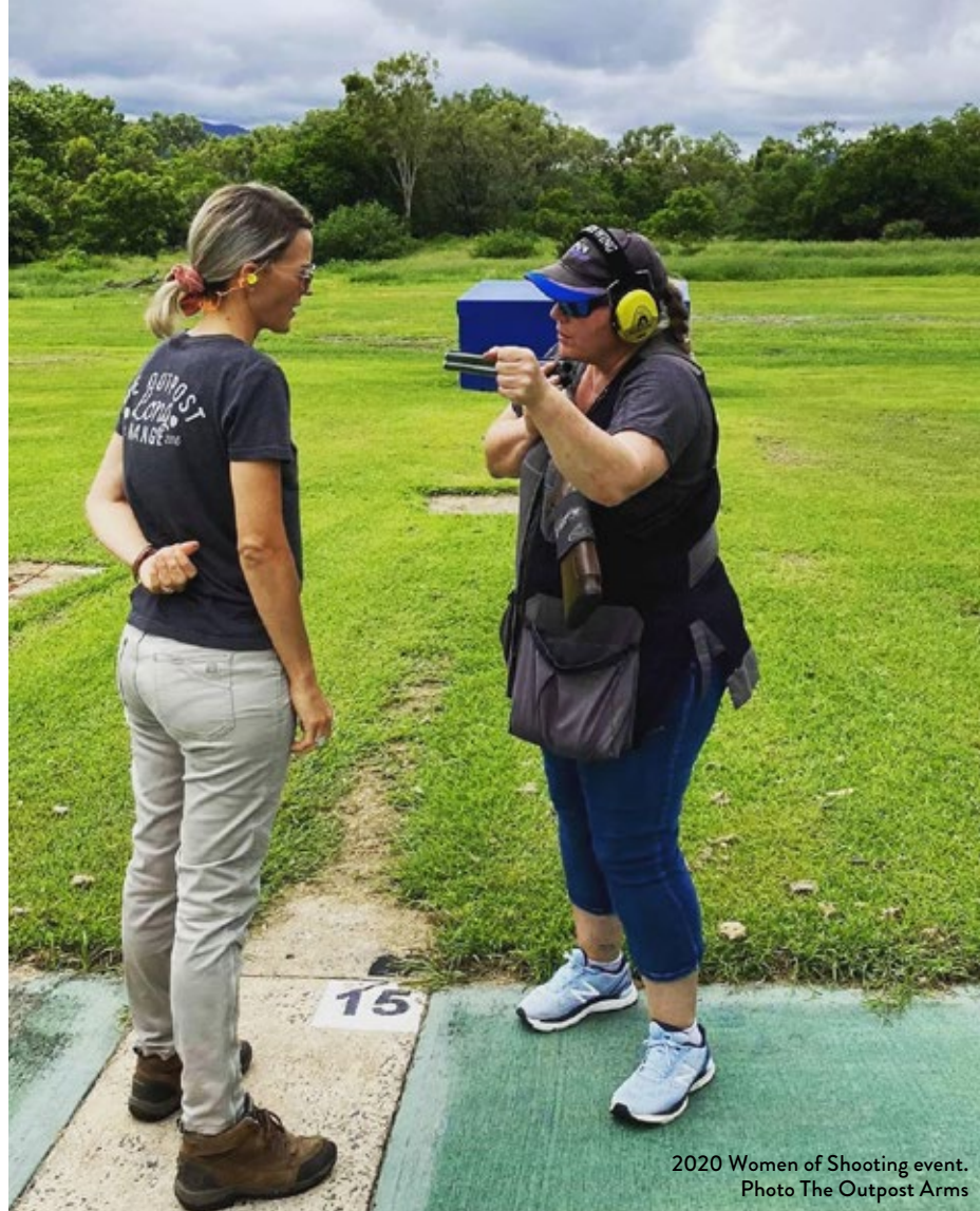
2020 Women of Shooting event.

During my first Olympic final my heart rate was maxing out at 180bpm for about 40 minutes, I was breathing deeply, I had a tight chest, a dry mouth, sweaty palms and crazily my knees even knocked together at a couple of stages and towards the end when I knew I had won but still had three shots to go. I even started to cry. The crying was relief and also the stress response lowering.