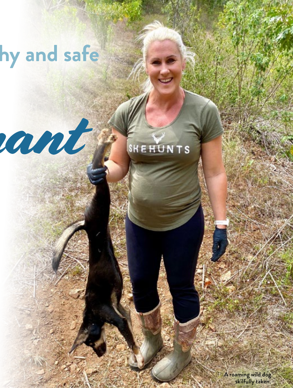
A roaming wild dog skilfully taken.

My midwife's questions were important. They all have varying answers, depending on what type of hunting you do and what species you are targeting. Here is my experience over nine months.