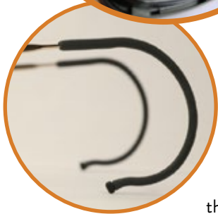
The nose-piece is easily adjustable.