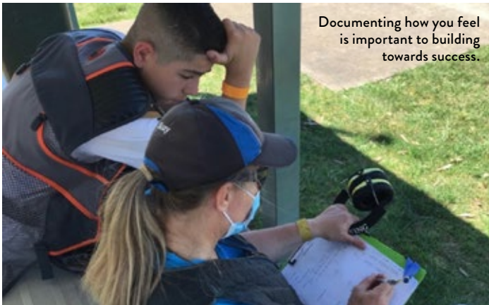
Documenting how you feel is important to building towards success.

My own father would experience a tight chest, cough or clear his throat when he became nervous – a trait I have too