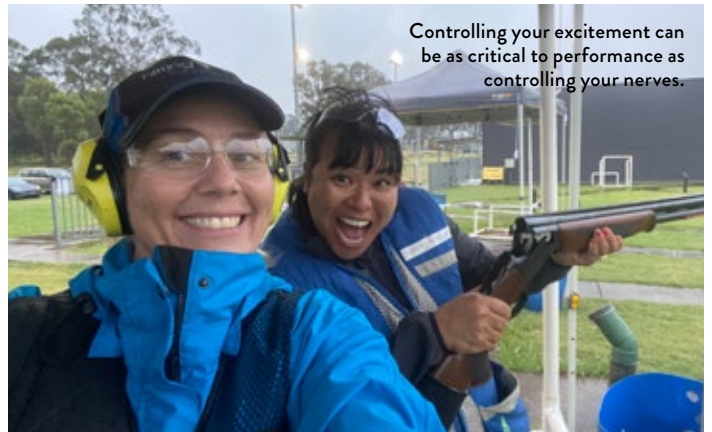
Controlling your excitement can be as critical to performance as controlling your nerves.