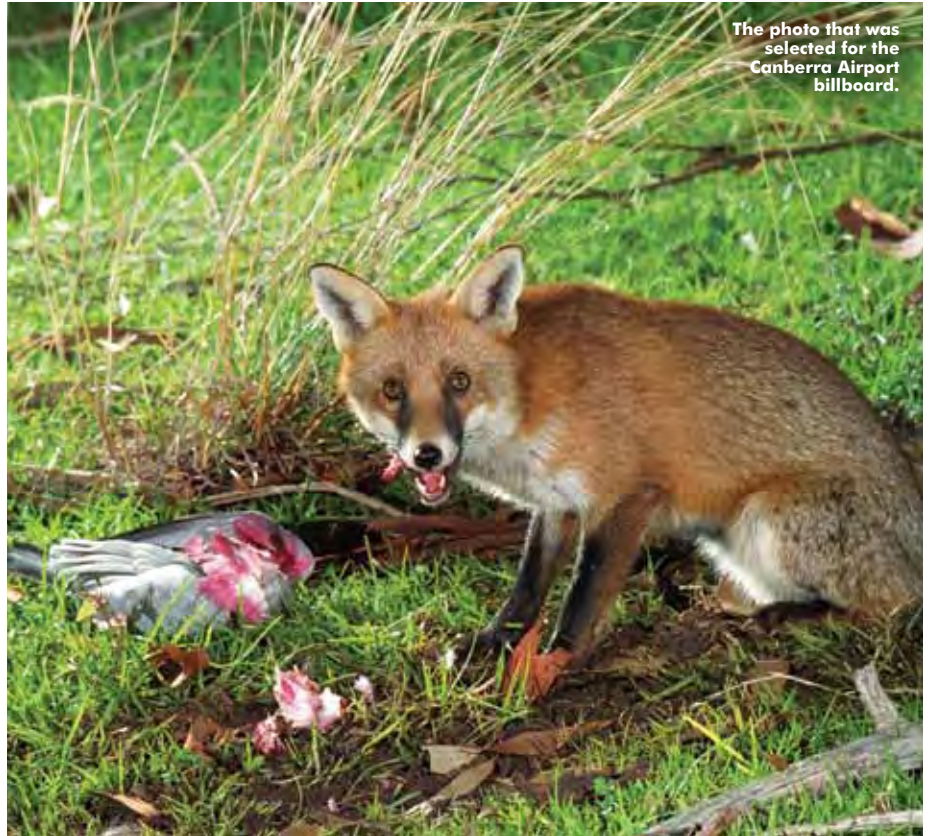
The photo that was selected for the Canberra Airport billboard.

For information on how you can help Australia's native wildlife and be part of the solution, visit www.ssaa.org.au ●