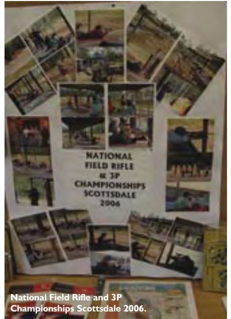
National Field Rifle and 3P Championships Scottsdale 2006.