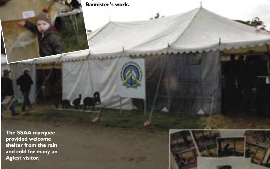
The SSAA marquee provided welcome shelter from the rain and cold for many an Agfest visitor.