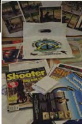
Potential SSAA members were given a showbag promoting recreational shooting and hunting.