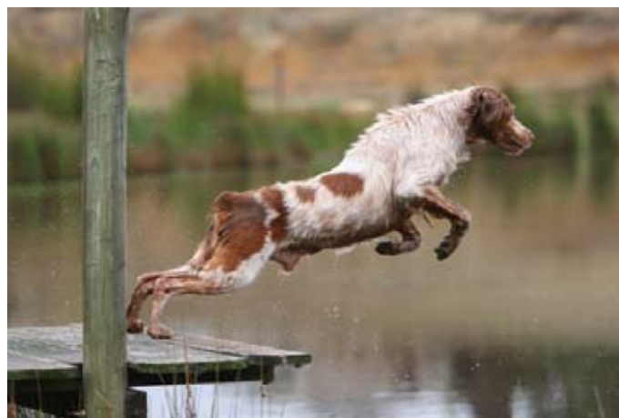
This keen L'Epagneul Breton (Brittany) is approaching its 11th year, but its years of being well cared for can be seen in the youthful vitality with which it enters the water.

Heatstroke is a life-threatening situation that gundog owners need to be very aware of. A sometimes strange malady, it can strike dogs on days that normally would not be regarded as too hot. I suspect it has more to do with dehydration. Whatever the reason, dogs should always have access to water before, during and after working and if a dog starts to show signs of heatstroke - shaking, falling over or glazed eyes - cool them down immediately with lots of shade and water. Fatalities through heatstroke are not uncommon.