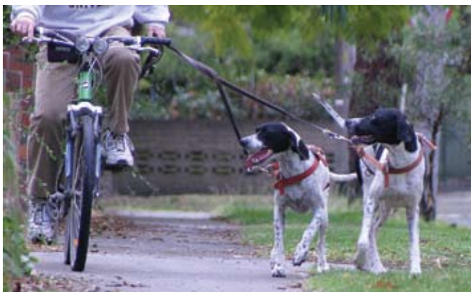
Mush! All gundogs require plenty of exercise. Running next to a bike is a great way to cover a lot of ground quickly.

Thoughtful handlers carry water sprays of the gardening variety on warm days and give their dogs a frequent damping down.