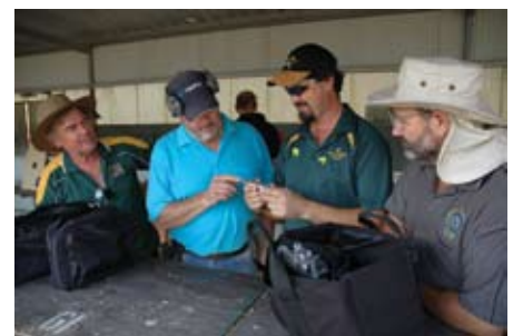
Pete's Gun Works mover mount creates a lot of interest at matches.

The pins and locking mechanism are machined and then all the pieces are hand-fitted together to a tight fit. The aluminium parts can be anodised different colors at the