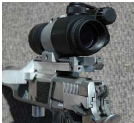
The direction lever (centre under the rear optical lens) is moved to compensate for the lead required on the moving target.